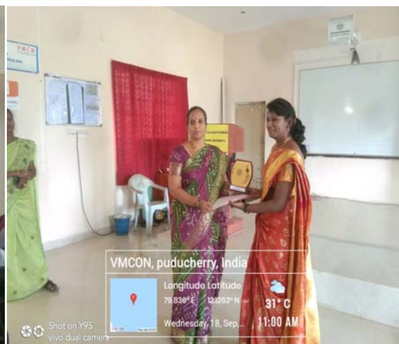
Organizing Chair Person cum Patron